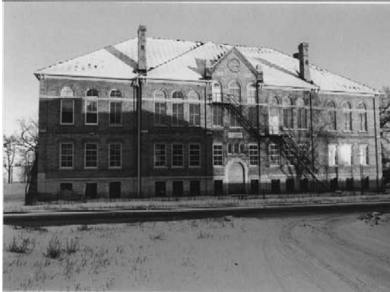
Original Northside Child Development Center, at Dupont and 14 th Avenue North, Minneapolis