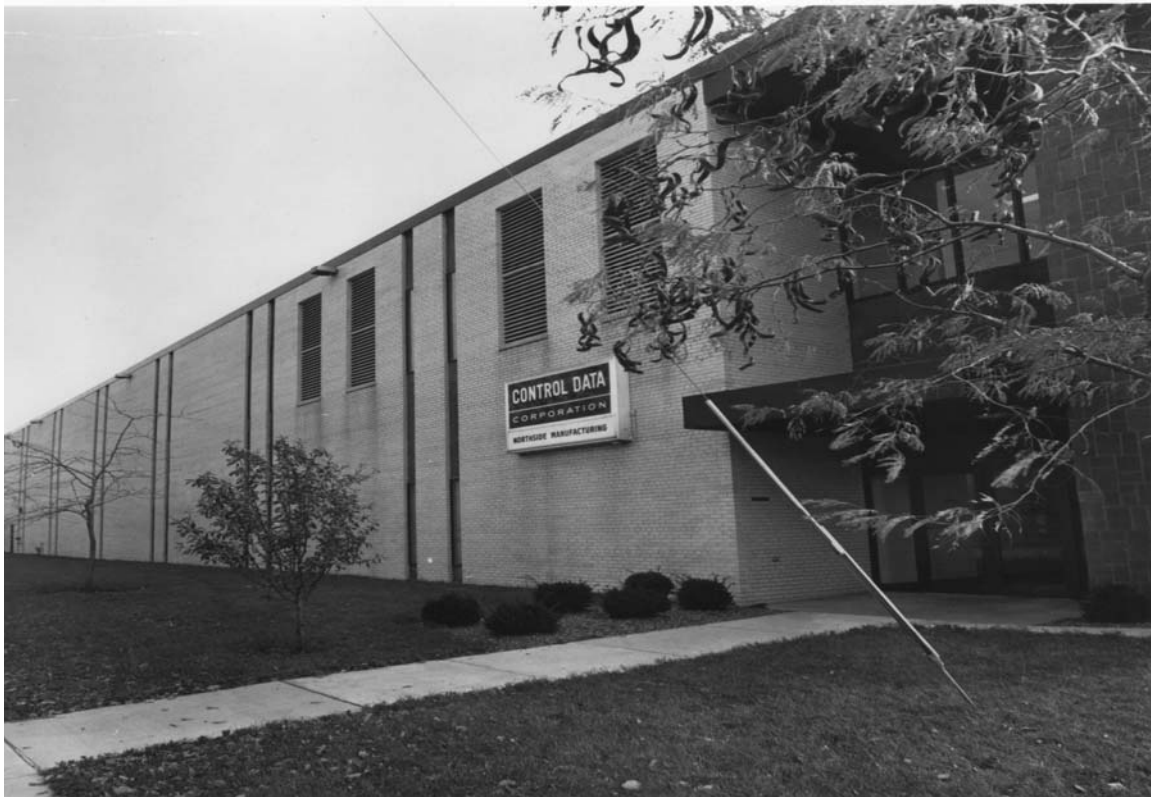
Northside Manufacturing Plant, 227 12 th Avenue North, Minneapolis