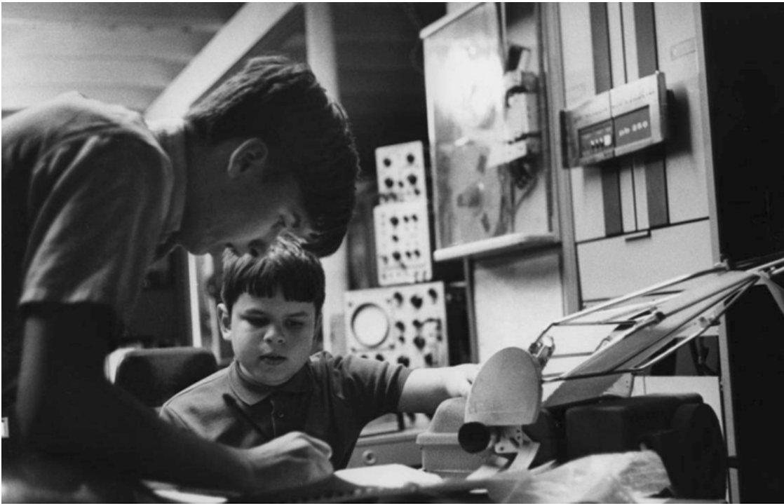
Two R.E.S.I.S.T.O.R.S. in the Computer Barn